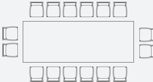
One Table Setup (max. 16 guests)

Please see overleaf for further seating plan suggestions